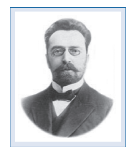
Figure 1. Alexander F. Samoylov (1867–1930).

At that time, the main research tool used to study electrophysiological processes was the capillary electrometer which Samoylov not only thoroughly explored but also improved in many ways by increasing its mobility, which allowed the curves representing the electrical processes in the heart of a frog to be recorded without lengthy correction and rectification, as had been required previously. He designed a photographic recorder with a fast-moving drum which could be used for reproducing electrical phenomena in the heart muscle on photographic film or paper. His electrograms, together with the atrial and ventricular mechanical curves, displayed all major phases of the cardiac cycle in a frog's heart: the relationships between electrical and mechanical processes involved in the work of the heart,